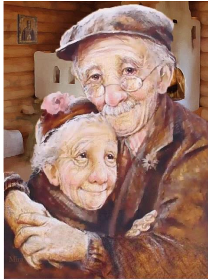
Loveable Ole & Lena